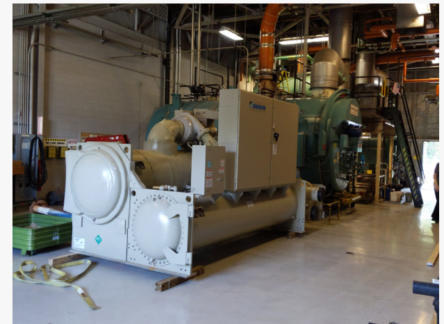
Magnitude chiller unit after being positioned in the central cooling plant facility