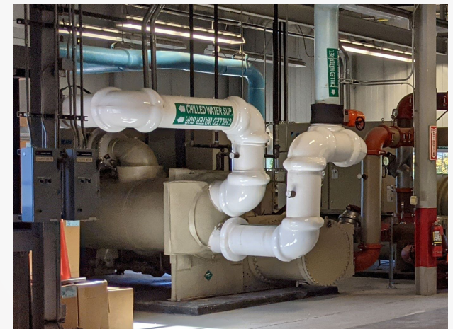
Magnitude chiller after the successfully completed installation