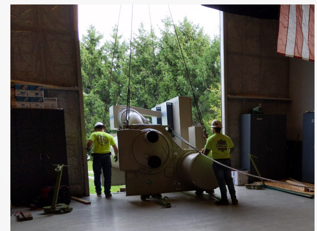
Magnitude chiller unit being lowered on site with additional crane rigging for assistance